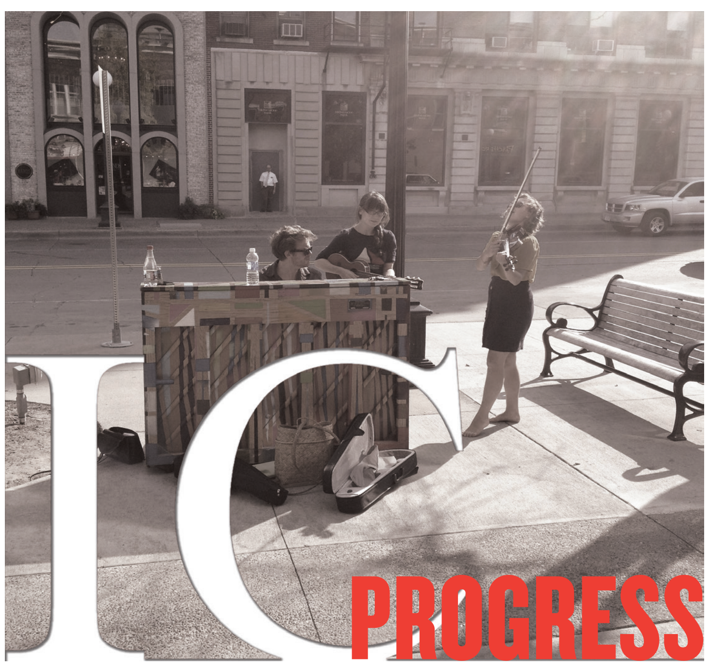
THE 2012-13 MISSION REPORT OF THE IOWA CITY DOWNTOWN DISTRICT